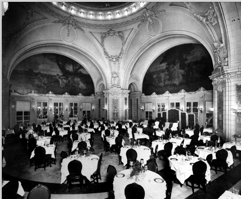
SINTON HOTEL, INTERIOR

Before the evening was out, plans were made for a serious meeting to explore the level of interest in a new organization and to establish a broad outline of its goals. During the first months of 1920, that Christmas dream was transformed into reality. A new organization began to take shape: the Disabled American Veterans of the World War—the DAVWW.