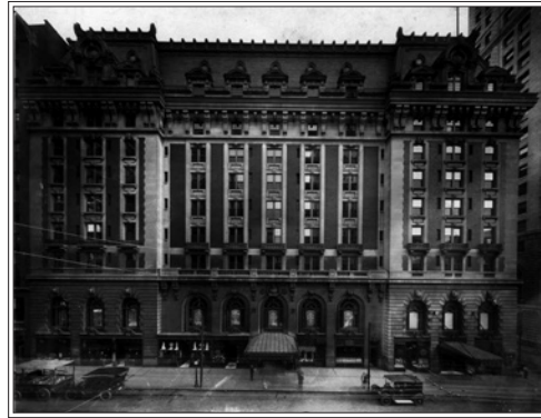
SINTON HOTEL, EXTERIOR

Perhaps Judge Marx directed conversation at the party to the topic of doing something about the mess the government had made of its programs for veterans. That was always the belief among the earliest members of the Disabled American Veterans (DAV), several of whom attended that party.