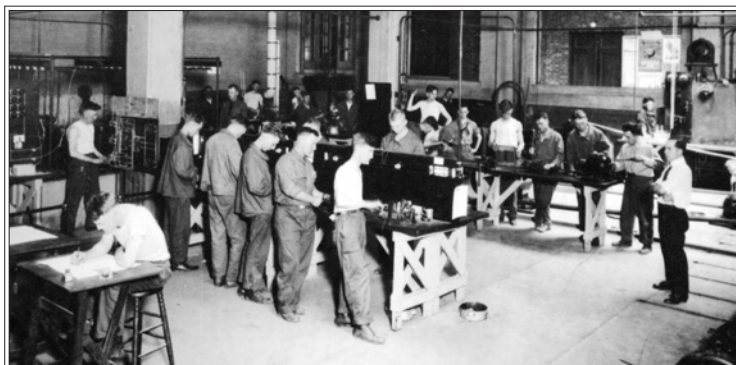
OHIO MECHANICS INSTITUTE, 1920s