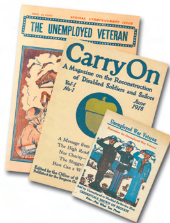
EARLY VETERANS' PUBLICATIONS

Our Nation's citizens witnessed war-wounded heroes sitting in the streets with tin cups and signs reading: "Help Me, I'm a Disabled Veteran."