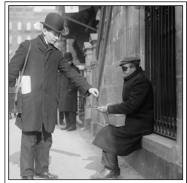
NEW YORK, 1920s

More than 4.7 million Americans served, and 53,500 sacrificed their lives in combat. Accidents and illnesses, mostly deadly influenza, took the lives of another 63,000. An astonishing 204,000 Americans in uniform were wounded during the war.