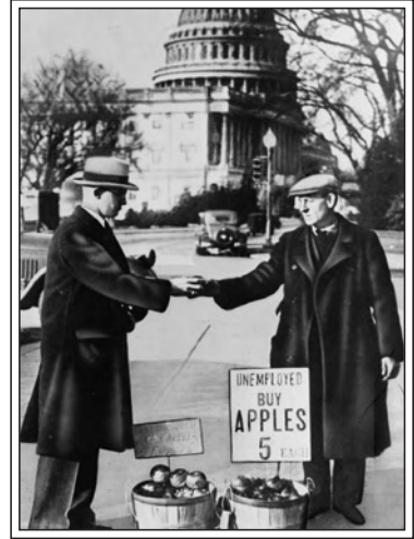
WASHINGTON, D.C., 1920s