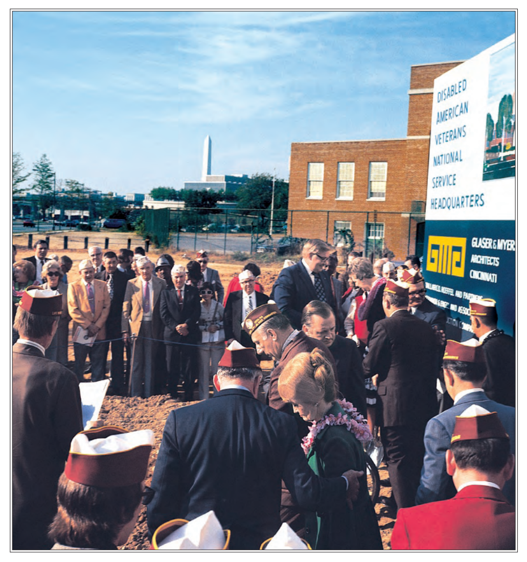
GROUNDBREAKING FOR THE NATIONAL SERVICE AND LEGISLATIVE HEADQUARTERS, 1973

Soon the FSU fleet was increased to 18 vans. Over a 19-year period, they brought the DAV's service to 608,000 veterans and members of their families before the program was retired in 1993.