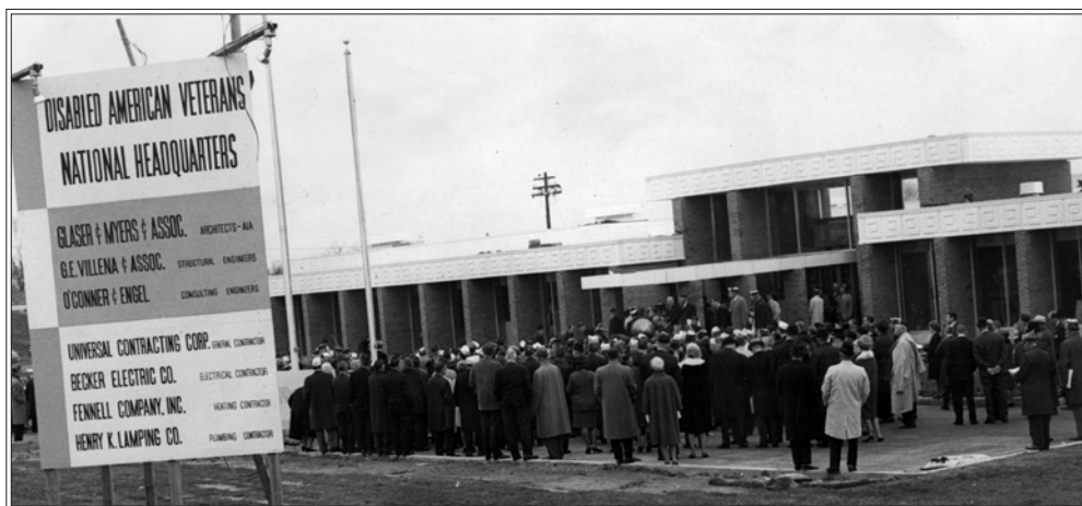
DAV NATIONAL HEADQUARTERS DEDICATION, COLD SPRING, KENTUCKY, 1966

Several factors prompted the move, including the business taxes the DAV had to pay the State of Ohio for its Cincinnati headquarters. Kentucky had no such tax at the time.