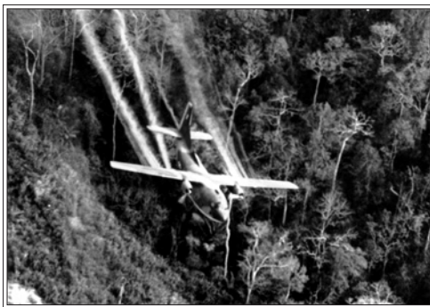
A C-123 PROVIDER AIRCRAFT SPRAYS AGENT ORANGE IN VIETNAM

The dedication shown by our Nation's Vietnam veterans serving as DAV NSOs was extensive. At one time, Vietnam veterans comprised more than 80 percent of DAV's National Service Officers. Their determined hard work in support of disabled veterans and their families was significant as they faced a long period in which such issues as Agent Orange and chemical and biological testing issues were slow to evolve. The federal government was slow to answer questions about exposure, anticipated illnesses, and critical consequences. Years would pass before illnesses were diagnosed as service connected. It was the DAV's corps of NSOs that dutifully and relentlessly persisted on behalf of our Nation's veterans to ensure that the service and sacrifice of our Nation's Vietnam veterans would be honored as much as those of veterans of all wars.