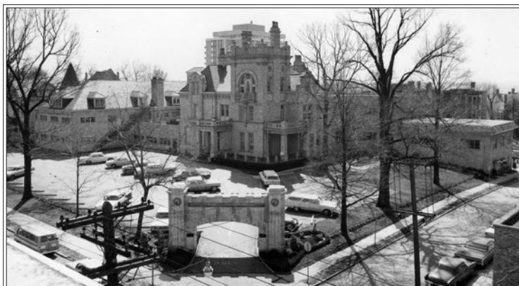
DAV NATIONAL HEADQUARTERS, CINCINNATI, OHIO, 1960's

The decision to build a new National Headquarters in Cold Spring, Kentucky, had been made in 1964. The 31-acre site selected was just a few miles south of downtown Cincinnati. Ground was broken for the new 115,000-square-foot headquarters in ceremonies that climaxed the spring 1965 meeting of the DAV National Finance Committee.