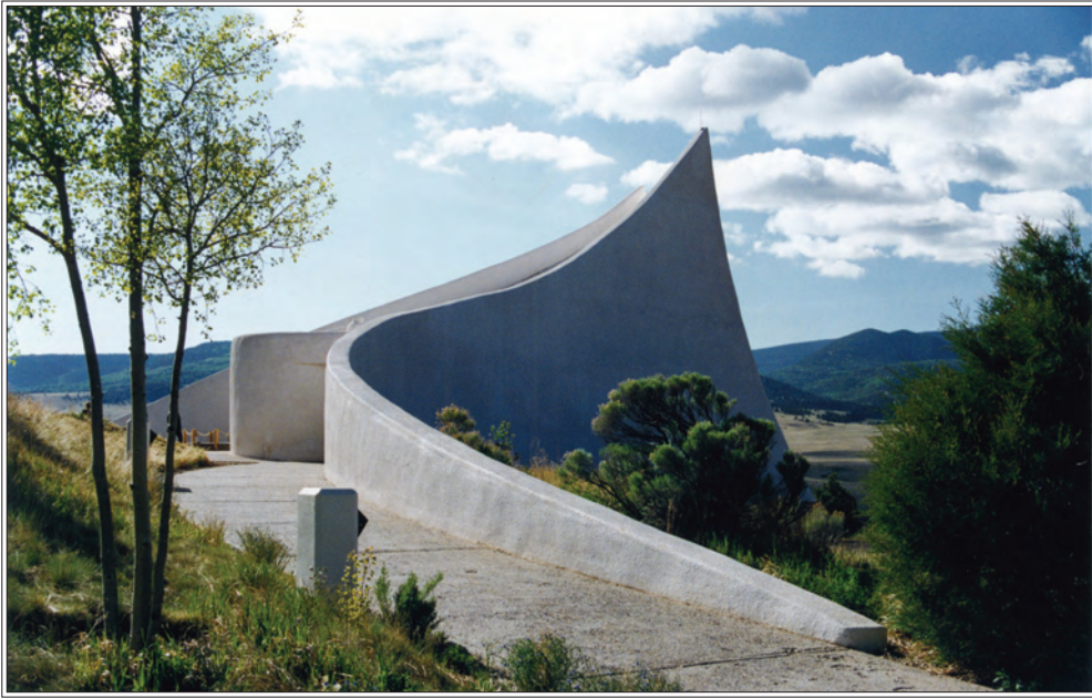
DAV VIETNAM VETERANS NATIONAL MEMORIAL, ANGEL FIRE, NEW MEXICO

On Memorial Day 1983, a beautiful shrine in Angel Fire, N.M., was rededicated as the DAV Vietnam Veterans National Memorial. This impressive monument rises majestically from a hillside above the Moreno Valley with the Sangre de Cristo Mountains as a backdrop.