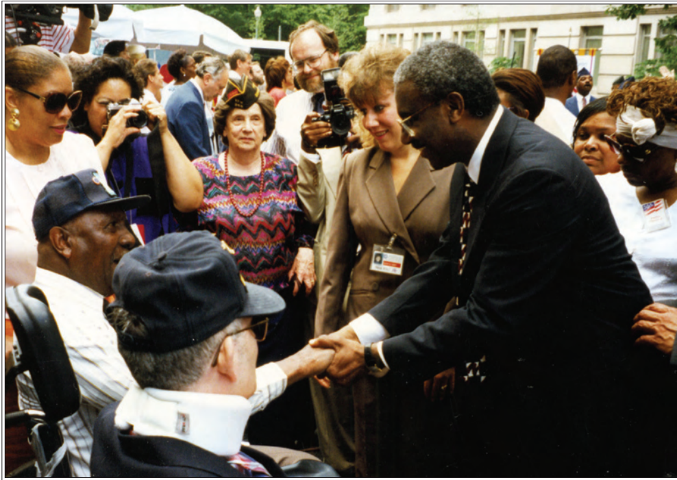
FORMER SECRETARY OF VETERANS AFFAIRS, JESSE BROWN

from opposition to support when it was finalized that veterans were to be accommodated. It then took several years for the Court of Veterans Appeals to become what the DAV envisioned—a court to assist veterans and not one that would damage or destroy the system that took care of veterans for so many years.