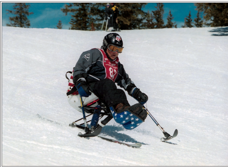
NATIONAL DISABLED VETERANS WINTER SPORTS CLINIC PARTICIPANT

Imagine the confidence a blinded or paralyzed veteran gains skiing down the side of a mountain in the Colorado Rockies. That's what the DAV means when it says that the winter sports clinic creates "Miracles on a Mountainside."