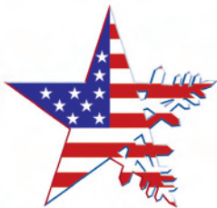
WINTER SPORTS CLINIC LOGO