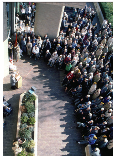
NATIONAL SERVICE & LEGISLATIVE HEADQUARTERS REDEDICATION