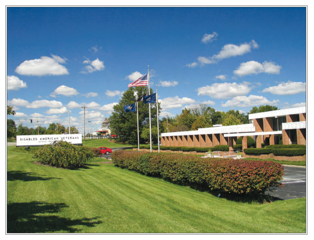
DAV HEADQUARTERS IN COLD SPRING, KENTUCKY, 2005

In the 21st century, the DAV remains steadfastly loyal to the men and women who sacrificed for our liberty, both in the past and in the future.