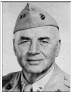
GENERAL MELVIN J. MAAS