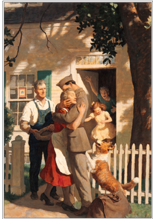
THE RETURNING SOLDIER —1944 BY N. C. WYETH