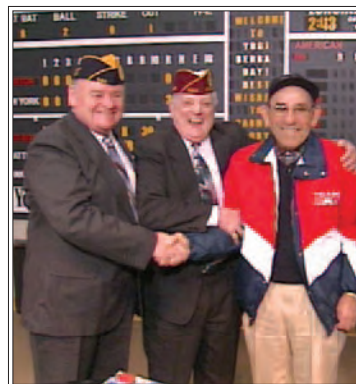
NEW YORK DELEGATION MEETS WITH YOGI BERRA